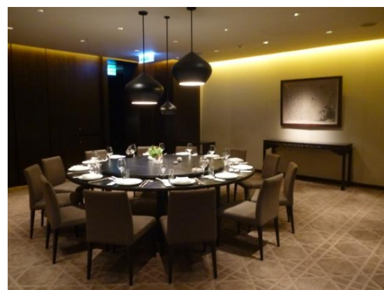
My Humble House